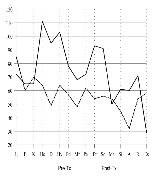
Fig. 1. MMPI Changes in an OCD case after 25 h of neurofeedback.

subscale. Once again, external validation of improvements and their maintenance was obtained by talking with his family.